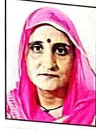
8 सिमरता (सदस्य)